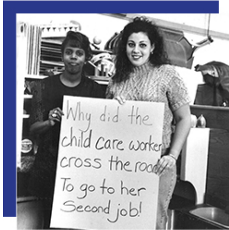
Members of the Child Care Employee Project call public attention to the plight of child care workers in 1994.