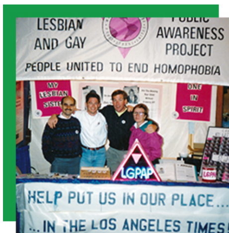
1990: The Lesbian and Gay Public Awareness Project.

But new national and state economic and anti-drug policies were having a significant impact on the lives of Angelenos: homelessness was rampant, the crack cocaine epidemic dealt South Central Los Angeles a severe blow, and the number of people in prisons increased dramatically. The 1984 passage of anti-immigrant Proposition 187, which would have denied undocumented individuals all public services and would have required teachers and doctors to report the immigration status of students and patients, points to the backlash against the rise in immigration. Among its grants to organizations working on immigrant integration, Liberty Hill funded a post-Proposition 187 hotline run by the Coalition for Human Immigration Right of Los Angeles (CHIRLA).