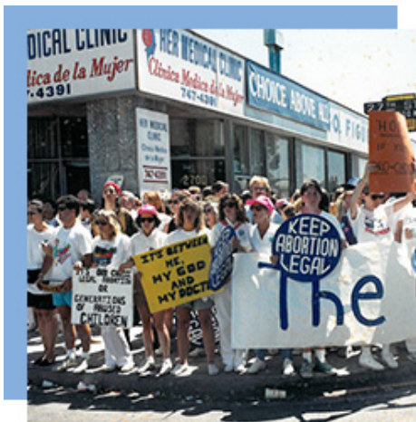
1990: The Clinic Defense Alliance.

Because of the ongoing analysis of the community funding boards, Liberty Hill was acutely aware of increasing pressures on low income communities of color. In 1991, Liberty Hill hosted "Communities in Crisis: Racism, Poverty and Urban Violence," a conference that brought together 100 organizers representing more than 100 local groups to discuss strategies for easing racial tensions. A year later, U.S. Representative Karen Bass, who was then Executive Director of Community Coalition for Substance Abuse Prevention and Treatment and a member of Liberty Hill's Board of Directors, wrote for Liberty Hill supporters about causes and effects of the civil unrest that followed the King verdict. She pointed out that Proposition 13 (1978) had dramatically reduced funding for public services, and that a national climate of political hysteria about drugs was criminalizing whole neighborhoods. "Currently, 6.3 million Californians, many of them children, are without health insurance and basic medical care," she noted. "When the lack of resources blocks the ability to meet fundamental human needs, families and communities collapse from the burden." She described how "L.A.'s finest" had entered the renewed war on drugs "with battering rams, mass round-ups of youth, 'gang sweeps,' and attempts to prosecute adults for failing as parents."